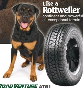
ROAD VENTURE AT51

Like a Rottweiler confident and powerful, all-exceptional terrain